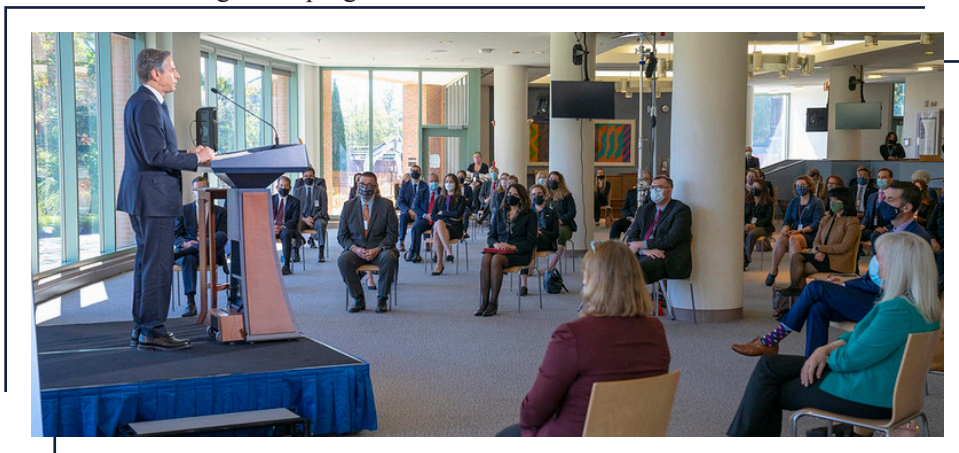
Secretary of State Antony J. Blinken delivers remarks on Modernizing American Diplomacy at the Foreign Service Institute in Arlington, Virginia, on October 27, 2021.

By September 30, 2026, strengthen the safety, security, and climate resilience of the Department of State and USAID's global real property platform and protect personnel through advanced building and sustainable asset management programs.