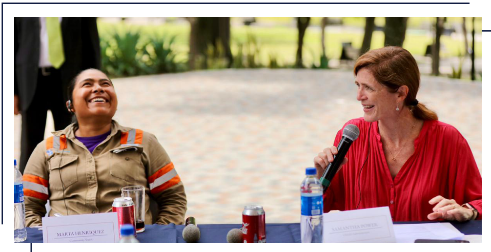
USAID PHOTO / EL SALVADOR USAID Administrator Samantha Power at a roundtable with participants in a USAID-supported job training program in San Salvador, El Salvador on June 14, 2021.