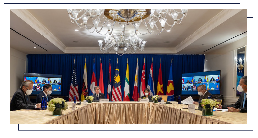
Secretary of State Antony J. Blinken meets with the Foreign Ministers of the ASEAN Nations on the margins of the 76th session of the UN General Assembly (UNGA 76) in New York, New York, on September 23, 2021.